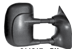
611817 - RH