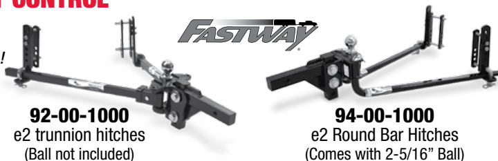
92-00-1000 e2 trunnion hitches (Ball not included)