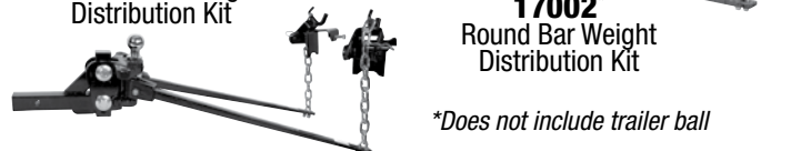
17002* Round Bar Weight Distribution Kit