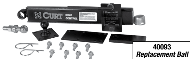
40093 Replacement Ball